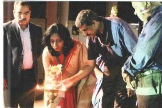
Inaguration by Lighting the Lamp