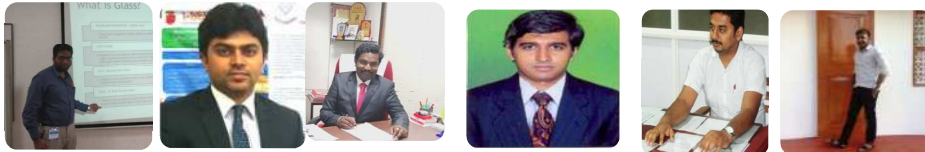
HOST CONVENER TECHNICAL EXPERT COORDINATOR MEMBER MEMBER

DEPARTMENT OF PG STUDIES & RESEARCH IN PHYSICS